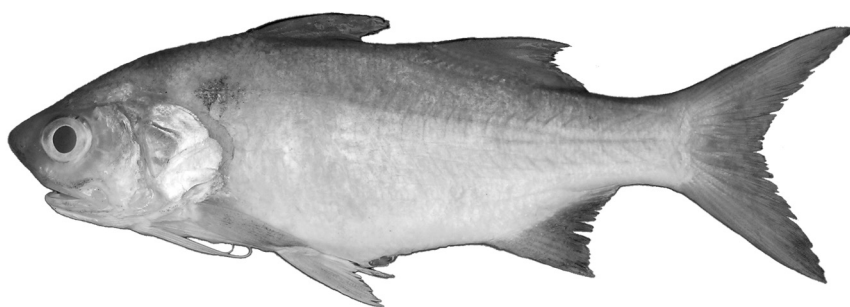
Figure 2. - Polydactylus mullani , MNHN ICOS-00314, 297 mm TL, Sur, Oman.